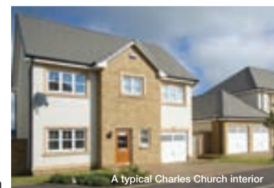
A typical Charles Church interior

For more information on Charles Church at Woodilee Village call 07712 653 274 or visit www.charleschurch.com