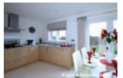
A typical Redrow interior

For the latest availability and prices, call 0845 676 0424 or visit the website: www.redrow.co.uk/developments/the-new-heritage-collection-at-woodilee-village2