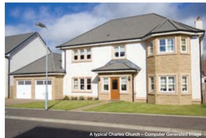
A typical Charles Church - Computer Generated Image

Ingrid continues: "Because of the property mix, and the fact that we have incorporated a greater number of apartments into the development plan, we can support even more young professionals and first time buyers making their way onto the property ladder."