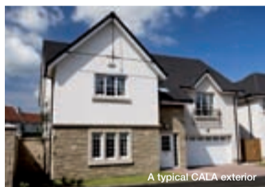
A typical CALA exterior