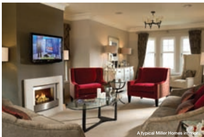
A typical Miller Homes interior

Alternatively, the modern four bedroom Derwent home offers plenty of room for an expanding and busy family.