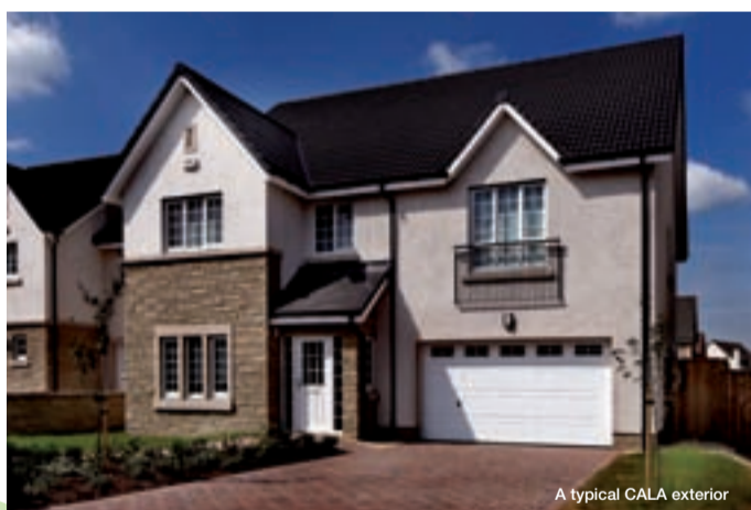
A typical CALA exterior

CALA's attention to detail is evident throughout, with the highest quality finish in every carefully planned room. Each home offers a generously proportioned, contemporary and flexible space, perfect for family life.