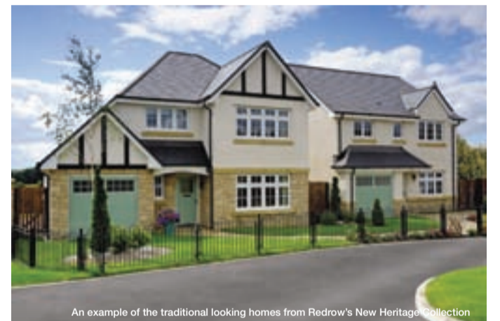
An example of the traditional looking homes from Redrow's New Heritage Collection

nail right on the head with our middle market, three and four bedroom family homes. They are really appealing to local families, boosted by the fact they have the advantage of falling within the catchment area for the well respected Lenzie Academy."